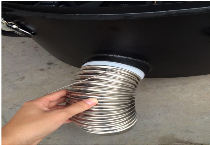
8.Fasten the metal button and the tube.